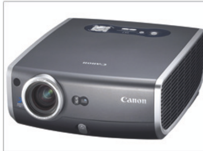
Optional SXGA Projector