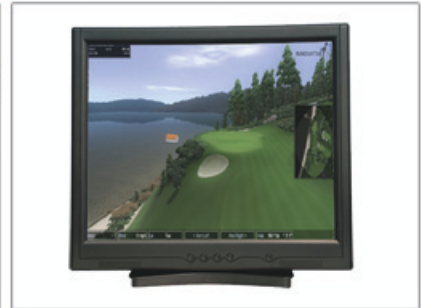
Optional 19" Touchscreen